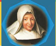
Blessed Marie Poussepin